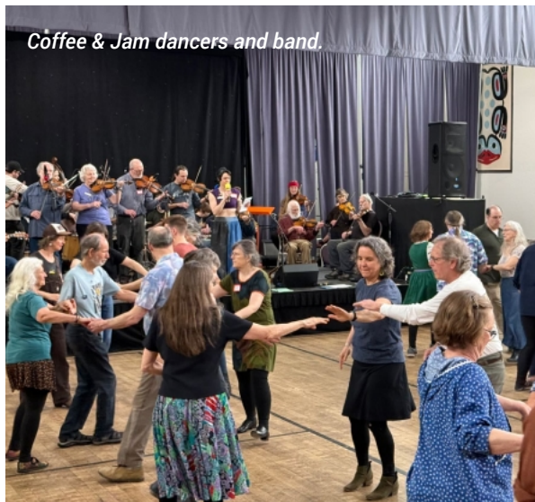
Coffee & Jam dancers and band.